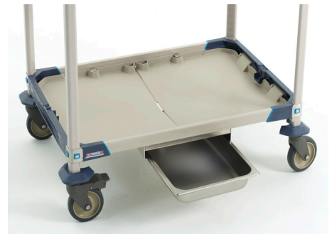
Mounted to a MetroMax i 24x36" (610x914mm) Frame. Steam Pan not included.