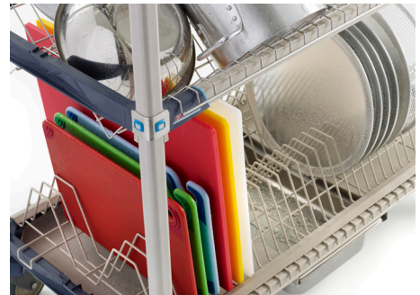
Mounted to 24x48" (610x1219mm) Open Frame with Tray Rack. Steam Pan not included.

Tip: Mount tray and pan racks on an open frame over the drip tray for maximum water collection.